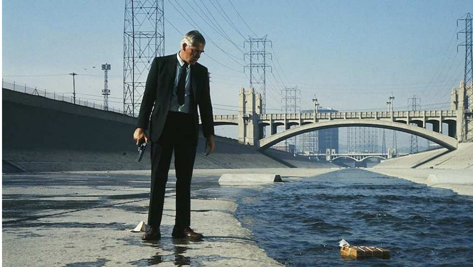
Lee Marvin sporting (not Florsheim) made-in-USA longwing brogues in tan pebble grain. Screen grab from the film Point Blank (1967).