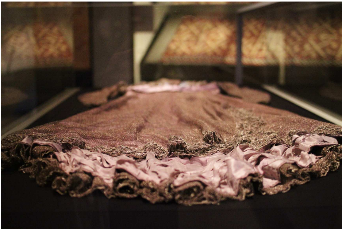
Pink gown, Royal Ontario Museum, 2013

Inspired by Tim Burton's film Alice in Wonderland (2010), Alfred Lord Tennyson's poem "Ulysses" (1842), and Melanie Benjamin's novel Alice I Have Been (2010)