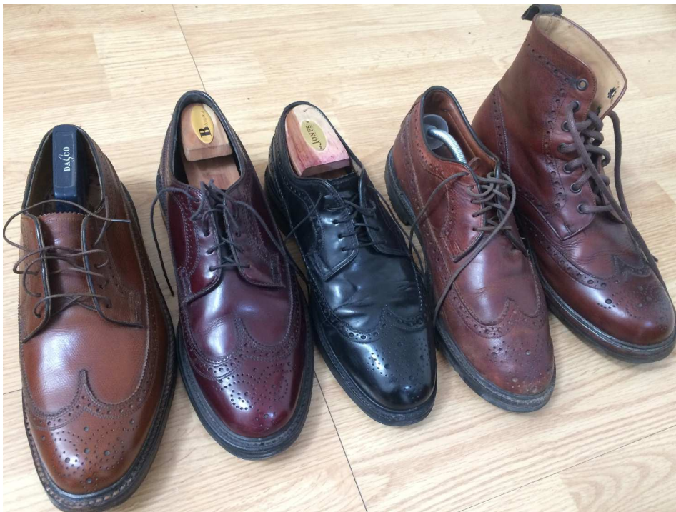
From left to right: vintage Florsheim Imperial, made-in-USA longwing brogues in tan pebble grain leather featuring original oak soles and v-cleat soles heels, vintage Dexter made-in-USA longwing brogues, Loake Royal longwing brogues, Allen Emonds waxy longwing brogues, Hoggs of Fife brogue boots.